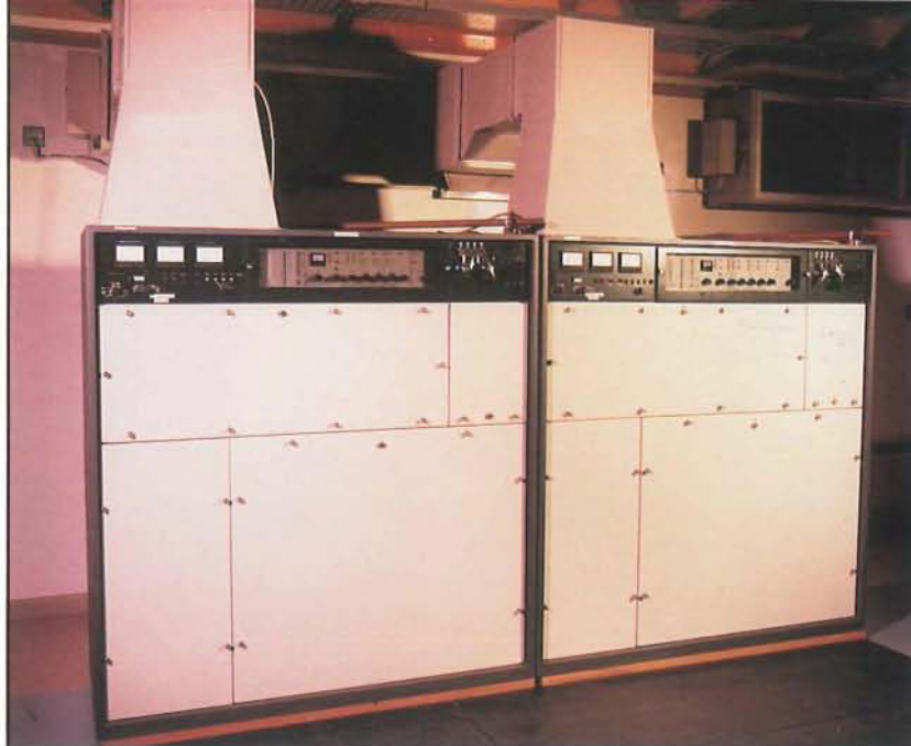
10 kW HF Transmitters

Automatic Channel Selection and Link Establishment removes the traditional HF problem of selecting the correct frequency for the required circuit and robust modems give excellent resistance to interference and propagation anomalies, such as fading and multipath. Frequency prediction programs can be used to select the optimum working frequency, but, without real time knowledge of local interference, they are at best only a guide. The DRA has a team of scientists researching and developing automated systems.