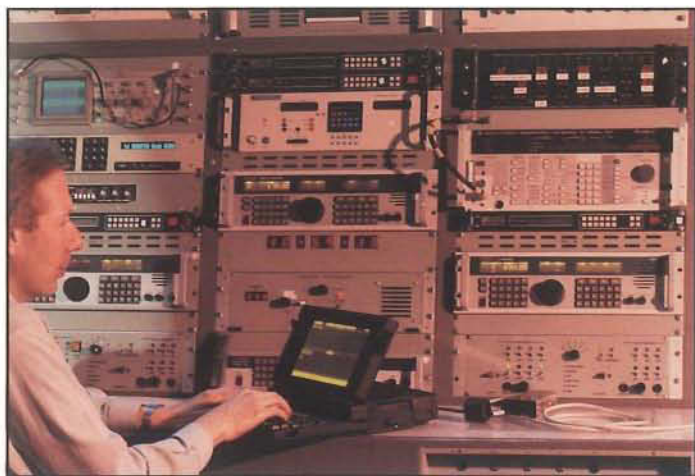
Main Communications Console