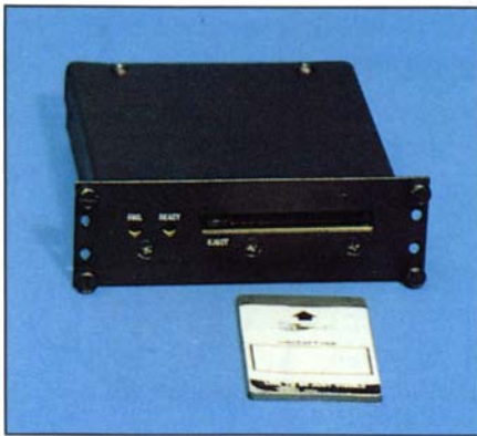
Card Maintenance Data Recorder.