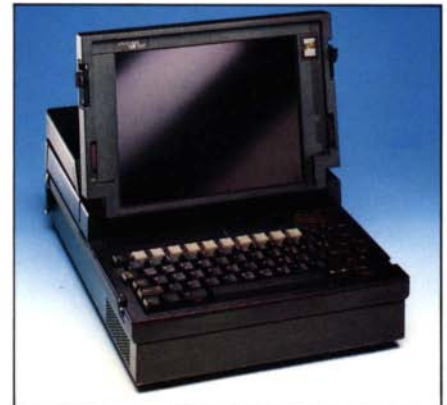
Ground Station Computer