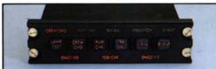
Pilot Interface Panel (PIP)

In addition to this core system, other options are available including: