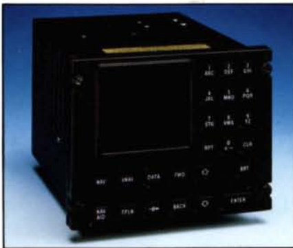
Control and Display Unit (CDU).