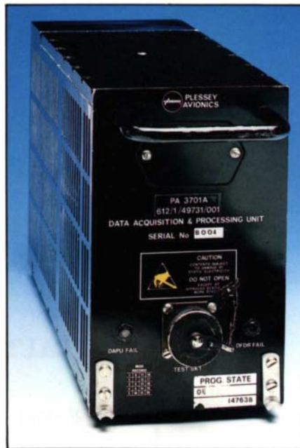
PA3701 Data Acquisition and Processing Unit (DAPU).

Selected mandatory data, together with raw and partially processed HUM data, is also fed to a ruggedised Maintenance Data Recorder. Data can be displayed on the optional Control and Display Unit as required.