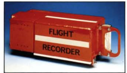
D51506 crash protected Cockpit Voice and Flight Data Recorder (CVFDR).

This CVFDR provides five hours of continuous digital recording at a data rate of 128 twelve-bit words per second and one hour of voice on each of three separate tracks. This capacity, in conjunction with a fully instrumented HUM capability, satisfies the new CAA and Air Navigation Order requirements for aircraft above 2700kg.