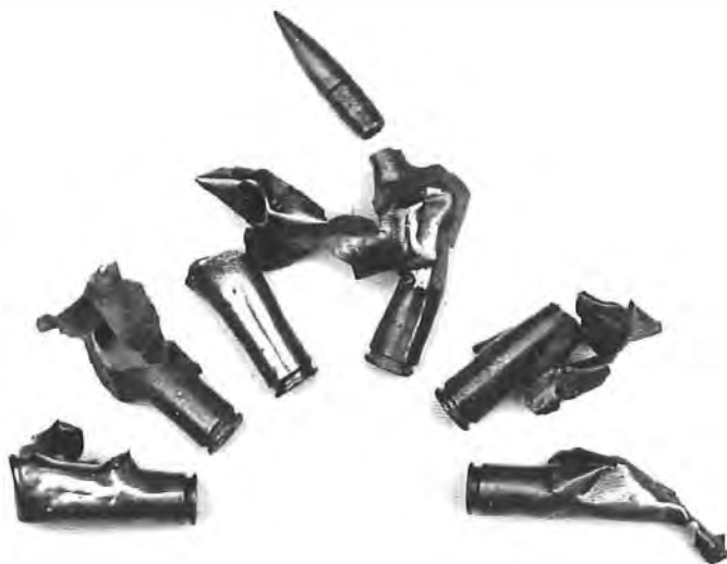
These 7.92mm exploded ammunition cases were found in the gardens of Nos. 4 & 6 Hardy Street 30 years after the crash.