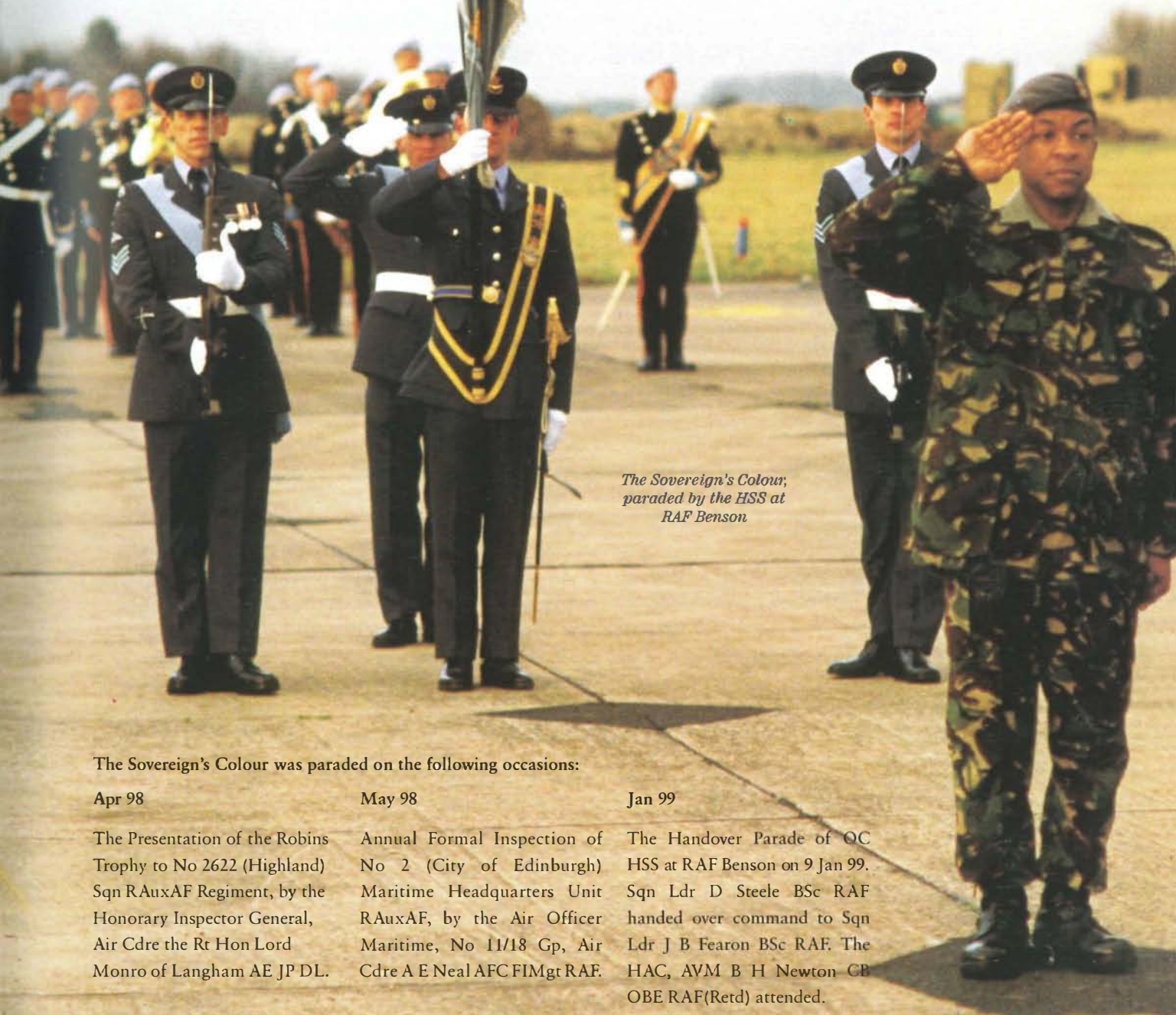
The Sovereign's Colour, paraded by the HSS at RAF Benson

The Sovereign's Colour was paraded on the following occasions: