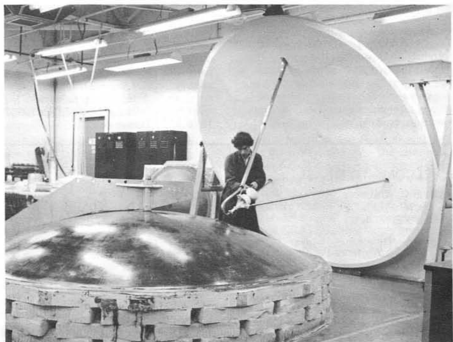
The dish in course of completion in the Lightweight Structures Department with Paul Bladen working on it. The mould is in the foreground.