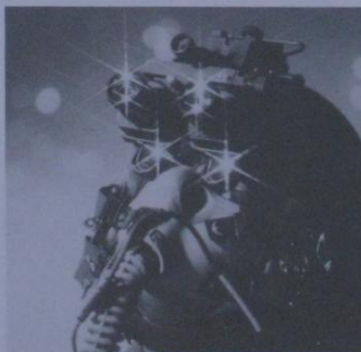
Cats Eyes Night Vision Goggles

The leader again checks his flight plan. Ten minutes to the Initial Point, known universally as the IP. Away to the north East he sees flak, several skeins of tracer arcing into the night sky. It must be the Tornados revisiting an airfield previously attacked some days earlier. The leader knows that they are deconflicted by fifteen miles.