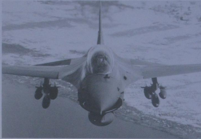
The general dynamics F-16, one of the many aircraft equipped with ADD products

It is early evening on an airfield in eastern Saudi Arabia. In a briefing room four pilots prepare for a night mission in the KTO, the Kuwaiti Theatre of Operations. The target is a radar and missile site which reconnaissance shows to have been reactivated since a previous attack. The weapons to destroy it have been selected and the routing has been worked out to avoid known missile engagement zones and other danger areas. Formation tactics and the final approach to the target have been chosen. It will be a covert mission, employing