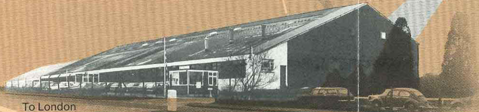
Flying School — Rochester