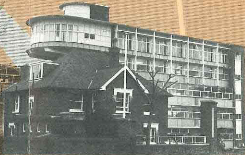
New Road Avenue — Chatham