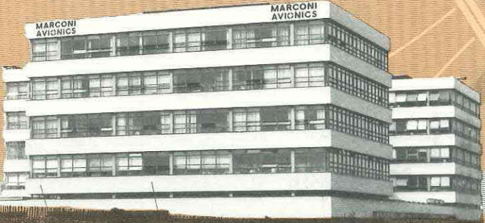
Airport Works — Rochester