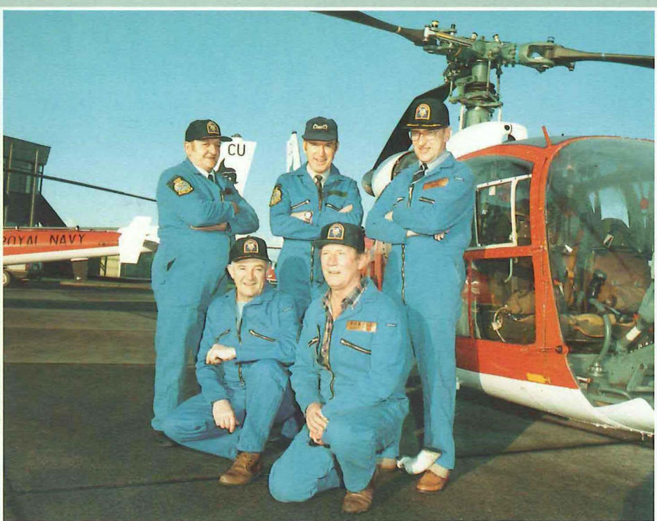
705 Squadron aircraft are maintained by Field Aircraft Ltd., who support the Sharks throughout the season.