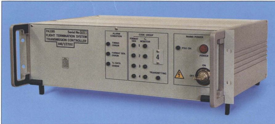
PA3305 PCM Transmission Controller

The PA3305 Transmission Controller is an integral part of the Range's command system and encodes the signals for transmission to the airborne Receiver Unit. It also monitors its own operation, checks the integrity of the transmitted signal and reports faults back to the Range Safety Control via a series of alarms. In complexity, the PA3305 may be considered as a sub-set of the PA3306 Ground Test Set in that the PA3306 includes the PA3305 features.