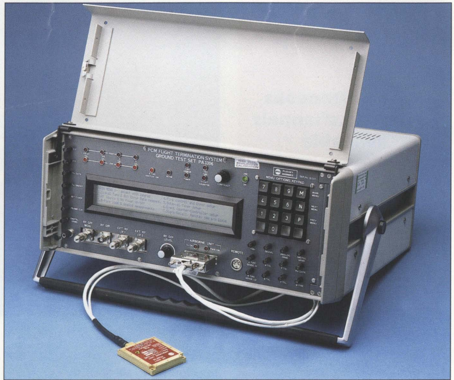
PA3306 PCM Ground Test Set

The PA3306 Ground Test Set provides a facility to comprehensively check all functions of the PA3301 PCM Flight Termination Receiver Unit prior to flight or for revalidation purposes. Check-out of an airborne Receiver Unit command circuitry is accomplished by monitoring responses to an internally generated FSK modulated RF signal. Data content and other characteristics of the signal are automatically selected by the test routine and could be either an airborne Flight Termination Receiver Unit data word or a pseudo-random data stream.