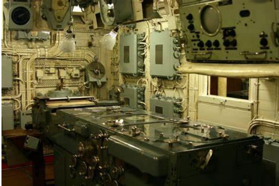
HMS Belfast Fire Control Table