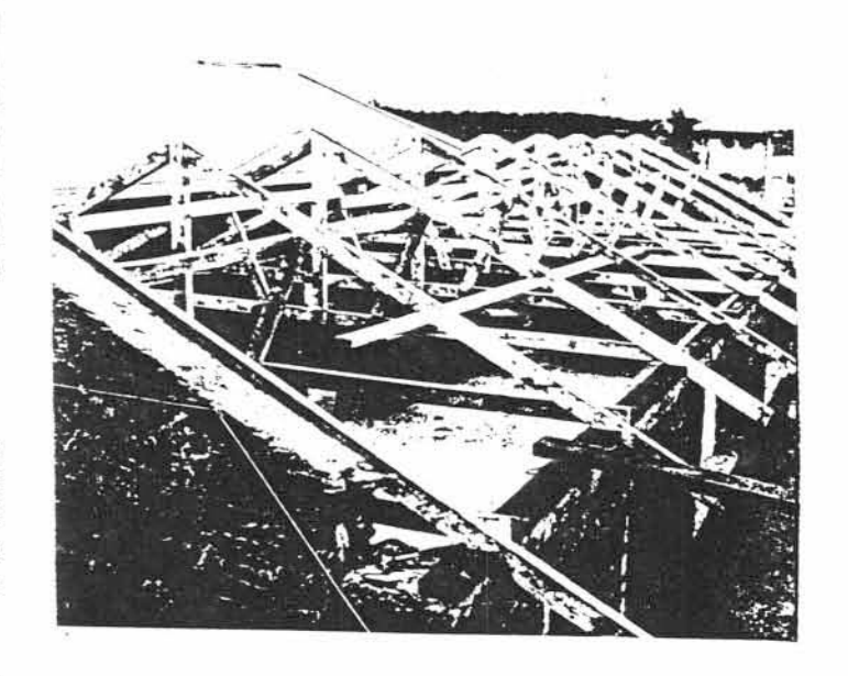
Halfway Through The Project

We subdivided into four teams, roofers. bricklayers, plumbers and electricians (I was a bricklayer) and set about our designated tasks. Our days started at 6.00am, up before dawn and a wash in cold Usually a wash consisted of water. Then breakfast, a brushing our teeth! cup of tea and start work at 7.00am. We all worked through until lunch time, 1.00pm, when we stopped for a couple of hours as the Midday Sun was too hot to work in. Start again at 3.00pm and work until 6.00pm when dinner would be ready. Time for a quick wash and then around the camp fire to sum up the day socialise. I've learnt many new camp fire songs, all excellent, but most unfit for print!