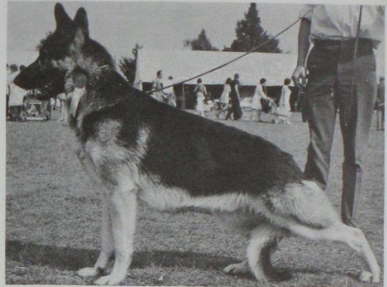
There were 158 entrants from all parts of south-east England in the dog show and, the overall winner was this magnificent Alsatian. Jim Tonkin (FCD) was amongst the judges.