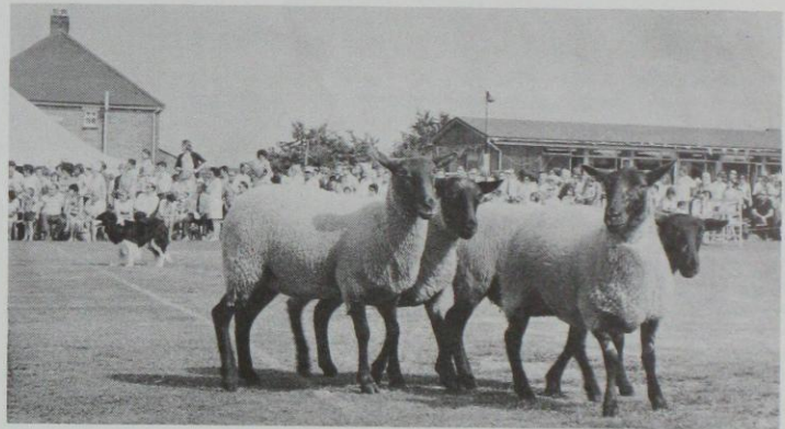
Everything is done by committee nowadays, they say. This meeting was to decide which way to turn during the sheep-dog demonstration. The decision makers had come all the way from North Wales.