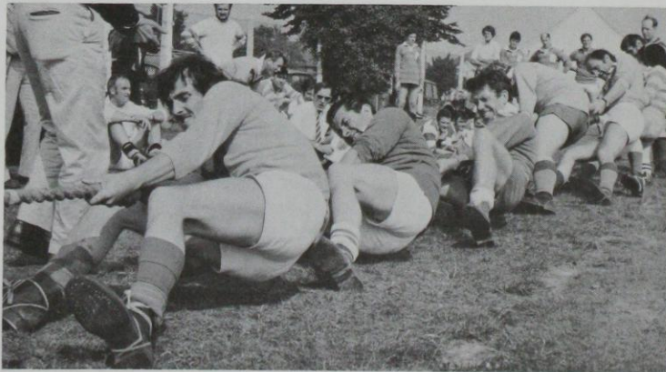
We are told that these straining gentlemen were Elliott "odds and sods" team, but they all pulled together.