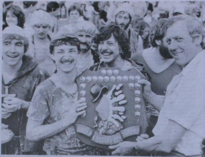
The Marconi Muppets receiving the World Championship Trophy.

So at the end of a great afternoons sport, the Marconi Muppets became the World Champion Custard Pie Throwers at this their third attempt. And next year? They'll be back to defend their title.