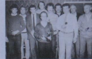
AS & R 'A' Combination and Crib team runners up.