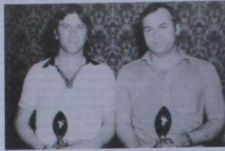
Euchre team runners up, ATE 'A'.