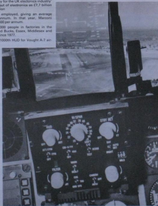
With the Marconi Avionics head-up display (HUD), pilots of the General Dynamics F-16 'fighting falcon' see a display of symbols, representing instrument readings, in focus with their view of the outside world. This enables them to fly safely and accurately without having to look down at instruments. This picture is a reconstruction, showing how Airport Works, Rochester, would look during an F-16 landing approach.