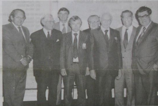
The Directors who entertained at lunch.

A large and representative contingent of employees from all sections of the works and divisions gathered in the conference centre, to witness the presentation.