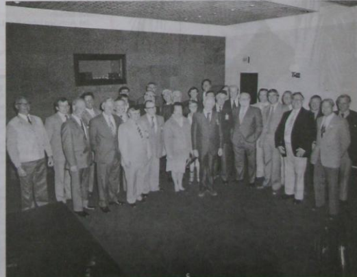
A few of the colleagues and friends present.