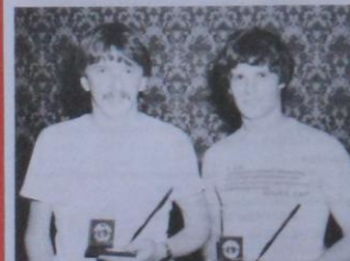
Euchre team winners, CAC.