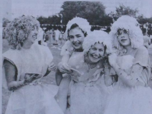
Though losers, enjoyment is the keynote.