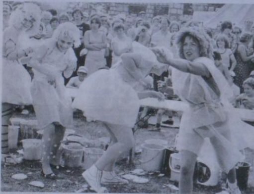
The Marconi Misfits in action—not only custard pies but happiness abounds.