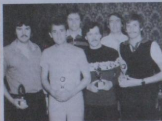
Model Shop 'B' darts team runners up.