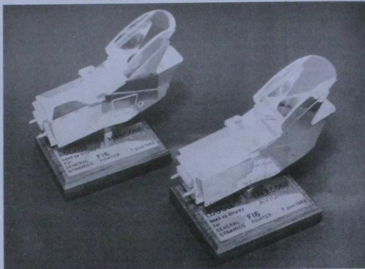
The presentation replicas, showing caption.