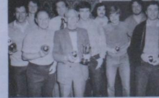
AS & R 'B' Combination and Crib team winners.