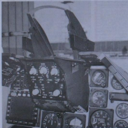
The Marconi Avionics head-up display is a central feature in the cockpit of the General Dynamics F-16 fighter. In use throughout every phase of flight, it provides the pilot with information for piloting, navigating and weapon aiming.

The Company also has a $5 million dollar development contract for a new range of aircraft computers for the US Air Force and US Navy for which production worth many hundreds of millions of dollars is forecast.