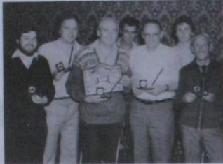
CMS 'A' darts team winners.