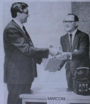
The formal handing over.