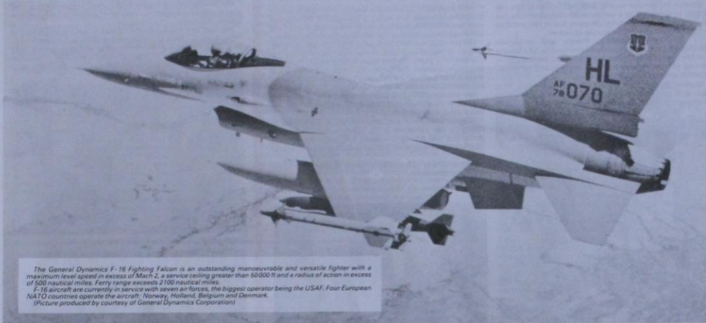
The General Dynamics F-16 Fighting Falcon is an outstanding manoeuvrable and versatile fighter with a maximum level speed in excess of Mach 2, a service ceiling greater than 50000 ft and a radius of action in excess of 500 nautical miles. Ferry range exceeds 2100 nautical miles. F-16 aircraft are currently in service with seven air forces, the biggest operator being the USAF. Four European NATO countries operate the aircraft: Norway, Holland, Belgium and Denmark.