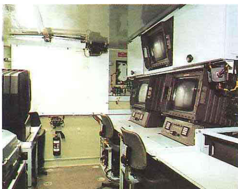
Ground Control Station

Phoenix has been selected for the British army. It brings an advanced real time surveillance system to operational reality. Phoenix has been developed by GEC Avionics, leading a team of multi-disciplined subcontractors, in response to a Ministry of Defence contract for a Battlefield Surveillance and Target Acquisition system.