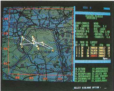
Mission Control Workstation Display

A mobile Forward Maintenance Facility supports all subsystems ensuring rapid repair and maintenance of all major elements of the system. Support Publications and Special-to-Type Test Equipment provide comprehensive support at both Organisational and Field level.