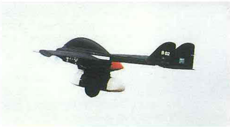
Phoenix Air Vehicle