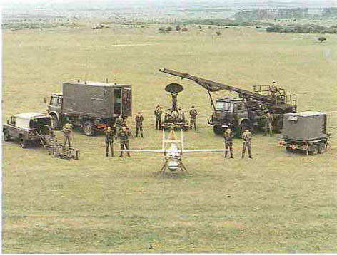
The Phoenix System