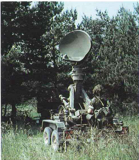
Ground Data Terminal