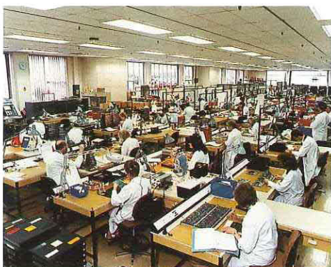
CACD's main production area

CACD is headed by the Divisional Manager who is responsible to the board of GEC Avionics for overall performance. The Division comprises Engineering, Production, Quality Assurance, Commercial and Marketing departments, each providing specific expertise to respond to all customer requirements. As well as CACD's own comprehensive resources, access is available to the considerable administrative, financial, and research capabilities of the Company.