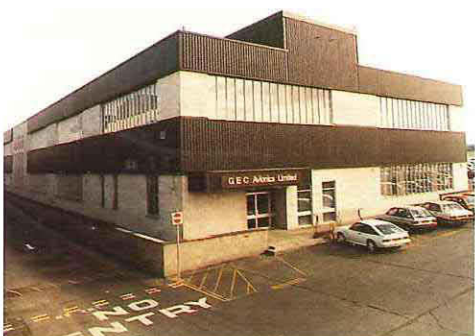
CACD divisional facility